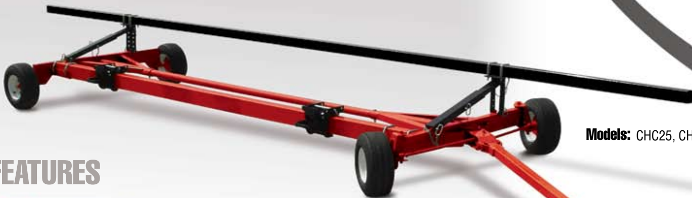
Models: CHC25, CHC30